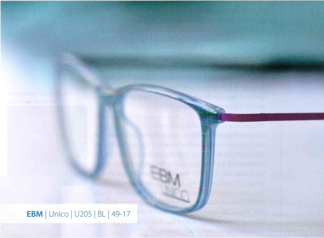
EBM | Unico | U205 | BL | 49-17