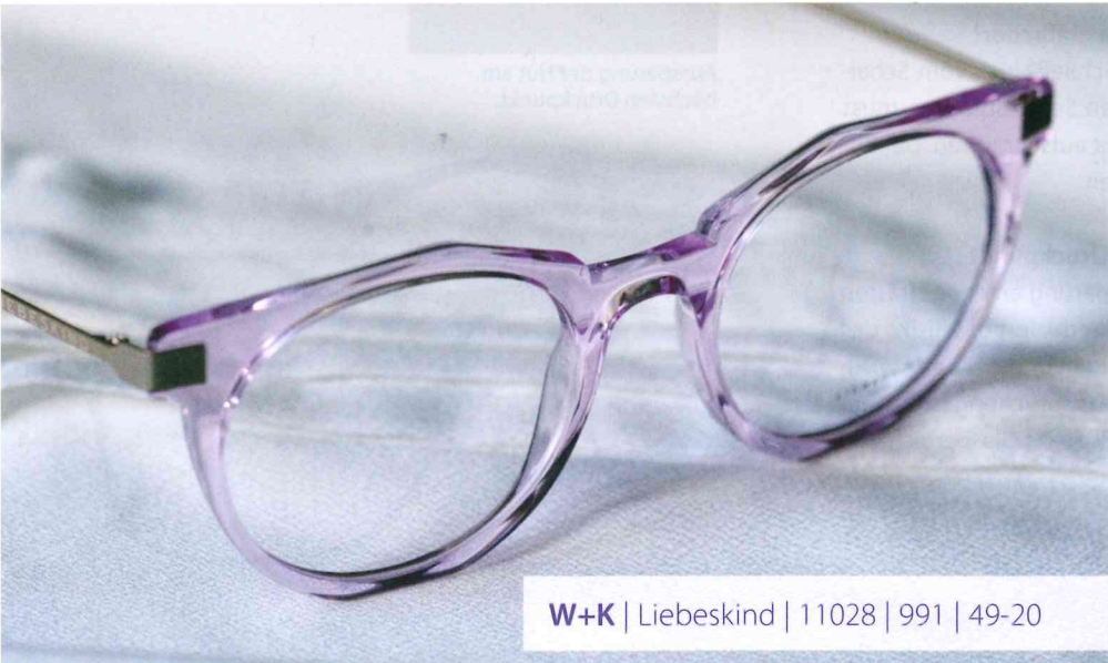
W+K | Liebeskind | 11028 | 991 | 49-20